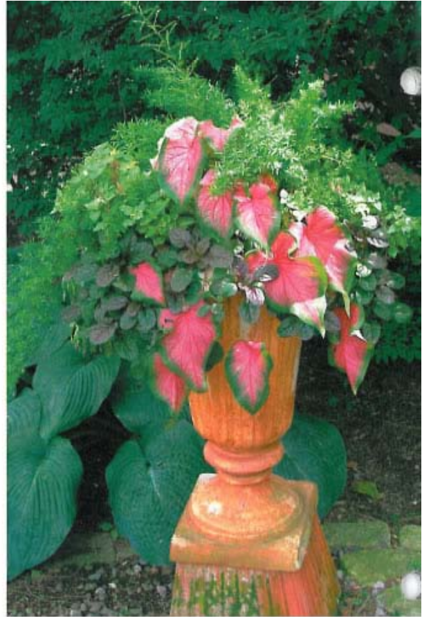
Garden Gate • June 2009 • Issue 87