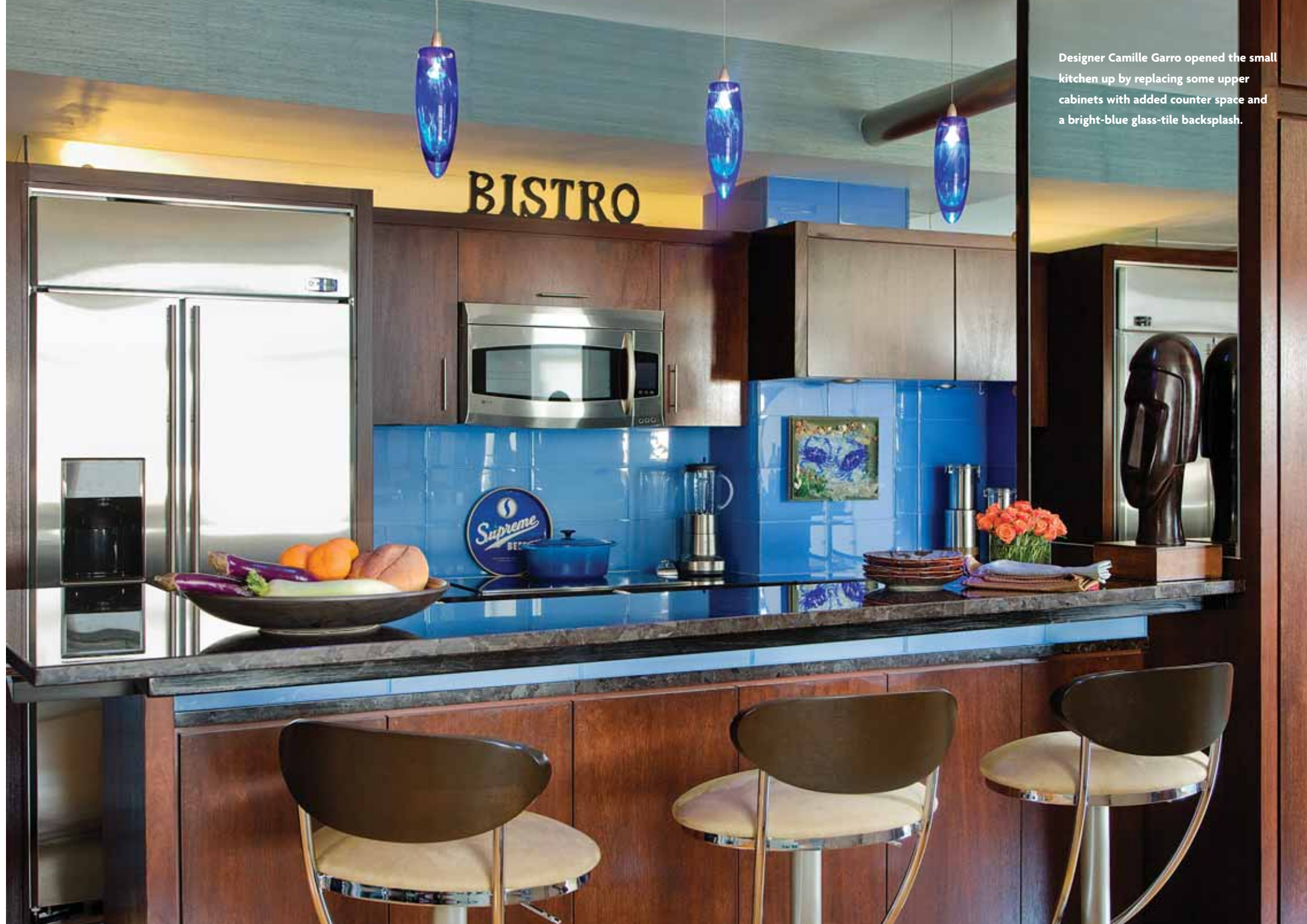
Designer Camille Garro opened the small kitchen up by replacing some upper cabinets with added counter space and a bright-blue glass-tile backsplash.

For more warmth, Garro added a spark of bright color here and there, putting pumpkin-hued pillows on the living room sofa and installing amber pendant lights above the dining table. "Karen wanted to keep it monochromatic, but I thought it needed just a pop